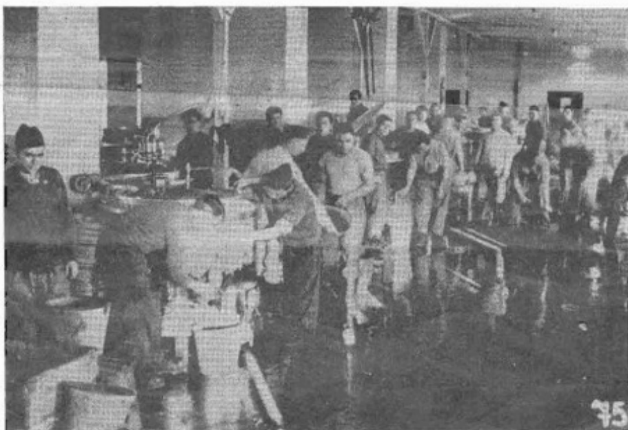
The kitchen at Stalag IV B. No names given.

4. "Sports" and "News from Home" really take us back and at the same time add to